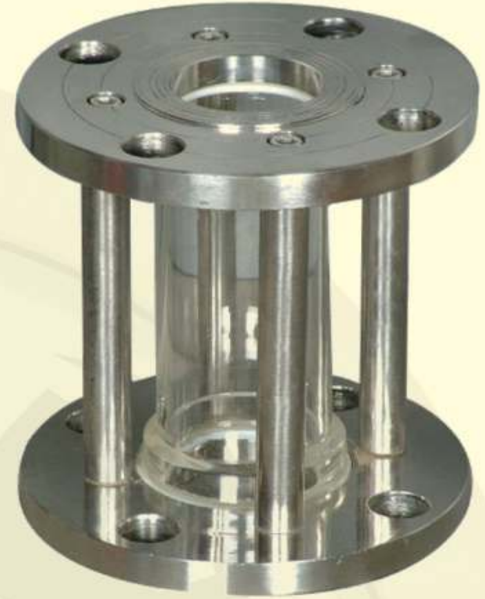
FULL VIEW SIGHT GLASS